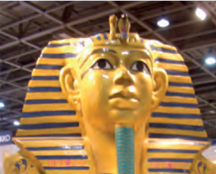
Symbols in Tourism