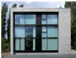
Infra-lightweight Concrete House

MaX - Museums at Public Access and Participation