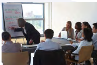
International Graduate Center

Design for Learning: A Dialogue among Designer, Educator and Learner