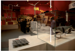
Bremen-Stand - Hochschule Bremen