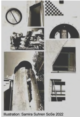
Illustration: Samira Suhren SoSe 2022

Various methods of interpretation/abstraction/composition are presented and practised in small exercises and workshops. Using these methods, you will then work out the specific characteristics of a location and develop the design of a small house (coupled with module BA 2.1). You will use pictures/drawings/graphics to show that it is ideally suited to the location, creates functional spaces and offers an appropriate, specific presence in the street. You will learn a variety of ways to present your design in plans, images, photographs and models and visualise and document your design in its own form using the appropriate methods you have learned.